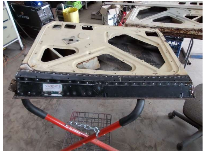
Door Rust: before and after

"The white car's gearbox is noisy in 1st and reverse, the blue car's box is nice and quiet, so I'll swap them over."