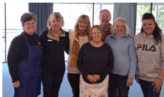
Sunday morning crew.