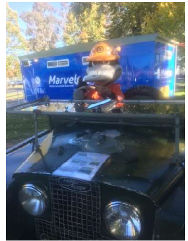
THE PHOTOS FROM THE SHOW.